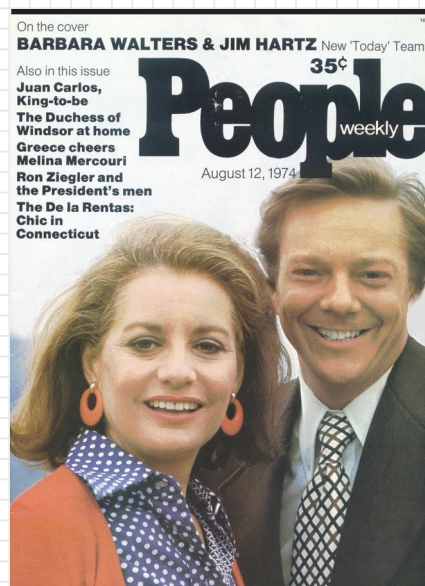
Barbara Walters & Jim Hartz